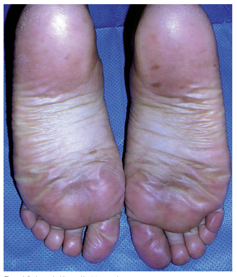
Figure 4. Erythema, shedding, and lentigines on soles.

Hair growth abnormalities<sup>2,3,16,18</sup> (18 percent). They appear later, from 2 to 6 months after treatment onset and usually disappear a month after treatment has been completed. They consist of the lengthening (trichomegaly), thickening, and curving of eyelashes and eyebrows.<sup>19</sup> Beard grows more slowly and moderate scalp alopecia may be seen. With time, facial<sup>8</sup> or generalized hypertrichosis usually occur. Scalp hair tends to curl or become straighter.