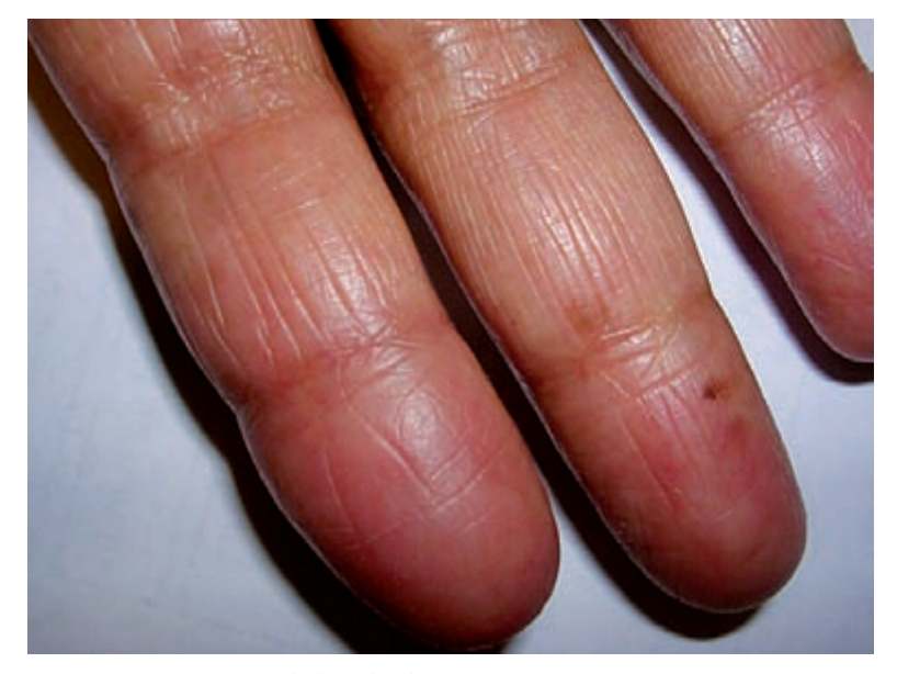
Figure 5. Lentigines in various shades on hand.

Xerosis (4 to 35 percent). More frequent with gefitinib. It begins after several weeks of treatment, and is more severe in elderly patients. It is associated with pruritus and fissures, and more pronounced on legs, hands, and feet. Occasionally there is vaginal or perineal dryness, and cutaneous fragility.<sup>3</sup>