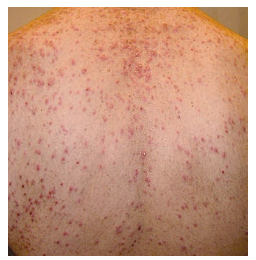
Figure 2. Acneiform reaction on the back.