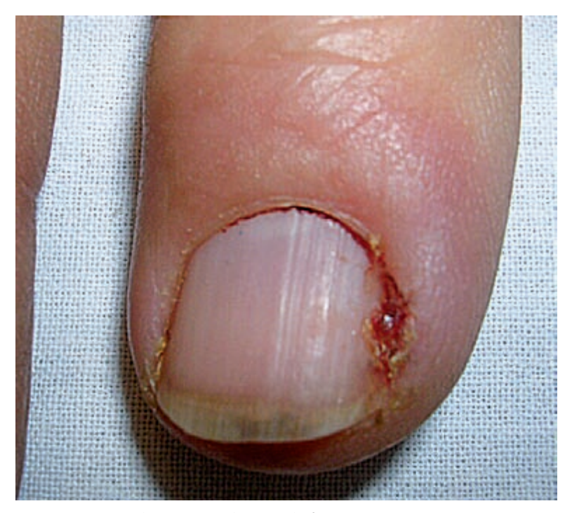
Figure 1. Perionyxis with pyogenic granuloma on index finger.

ne for a colon adenocarcinoma, presented with hyperpigmentation and fissured keratoderma. Appearance of 2 to 10 mm diameter brown macules on palms and soles in the last two months was ascertained. The histopathological study was similar to those of the preceding cases.