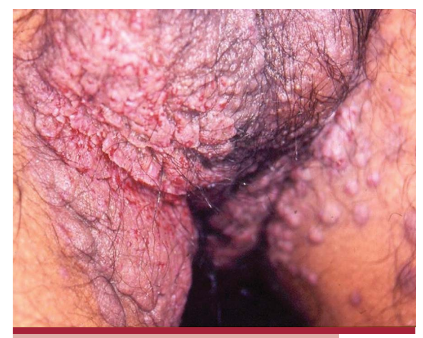
Photo 5: Inguinoscrotal and intergluteal fold. Vegetating lesions with erosive, oozing surface.

There are drug-induced cases, among which we can mention the angiotensin converting enzyme (captopril<sup>12</sup>, enalapril<sup>14</sup>) and penicillamine<sup>10</sup>. It has even been suggested that a patient might have developed pemphigus vegetans as a consequence of intranasal heroin abuse<sup>10</sup>. The chemical structures of both captopril and penicillamine are made up of highly reactive sulfhydryl groups which could bind to pemphigus antigens and generate acantholysis. Heroin could act as another ligand of these antigens<sup>10</sup>. In the case of enalapril, its relationship with pemphigus induction is not very clear-cut<sup>14</sup>.