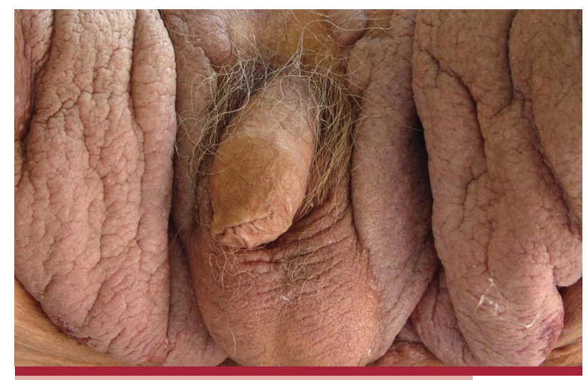
Photo 7: Inquinal region. Vegetating lesions of cerebriform aspect.

This being an infrequent disease, it is difficult to carry out controlled, randomized trials. Publications consist in series or isolated cases. Systemic steroids are the treatment of choice for most authors7. The patients who have the Hallopeau-type variant require low doses, whereas the ones with the Neumann-type one need higher doses<sup>2</sup>. Corticoids usually improve the lesions and are capable of inducing remission, but the disease tends to recur when their doses are lowered or they are discontinued<sup>7,19,27,29,36</sup>. In other cases, the vegetating lesions are refractory to such treatment<sup>36</sup>. The drugs which have been used associated to steroids as adjuvants with a good response include dapsone<sup>3,14,19,34,37</sup>, immunosuppressive drugs (azathioprine<sup>14,19,21,29</sup>, cyclophosphamide<sup>19,29</sup>, cyclosporine<sup>19,21,30</sup>, mycophenolate mofetil<sup>19,27</sup>) and retinoids (etretinate<sup>36,38</sup>, acitretin<sup>15</sup>). Dapsone inhibits the chemotaxis of polymorphonuclears. Retinoids reduce cell proliferation and have immunomodulatory and antiinflammatory effects, though they are not very well clear-cut. Other treatments to consider include intralesional corticoids and metotrexato<sup>19</sup>. Sawai et al describe a case of pemphigus vegetans with esophageal involvement which was successfully treated with minocycline and nicotinamide without association with steroids24.